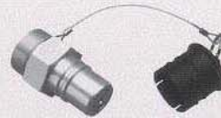
ZNC2A Receiver w/cap