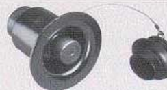
ZNC4 Receiver w/cap

Complete system components are described in Wiggins Service System Bulletin No. WSS-110. Please call for a free copy.