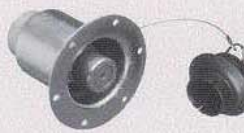
ZNC3 Receiver w/cap